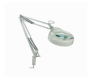
AO-MAG LIGHT MAGNIFYING LIGHT DESK MOUNTED

Colour: White 12.5cm round glass lens Magnification is 5 dioptr (2.2 times). 22 watt round fluorescent globe. Hinged lens cover.