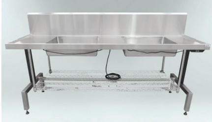
SP540 HEIGHT ADJUSTABLE SINK UNIT (2 SINK) ELECTRIC 240V

Dimensions: 2200W x 600D x (900 to 1150)H Bowl: 2 x 600 x 450 x 200 deep Rear Splash Back: 300mm Bench: Wet Edge Optional: 1 x Lower S/S Mesh Shelf