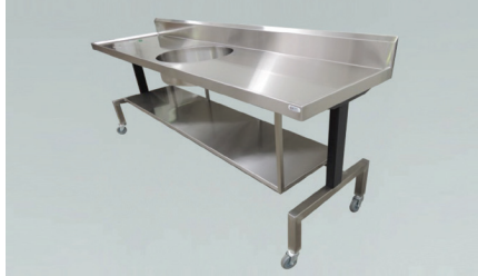
SP540.11 HEIGHT ADJUSTABLE SINK UNIT (CIRCULAR BOWL)

Dimensions: 2000W x 600D x (900 to 1150)H Bowl: 1 x 375 x 180 deep Rear Splash Back: 300mm Bench: Wet Edge Optional: 1 x Lower S/S Mesh Shelf (shown with Solid SS Shelf)