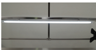
AO-UNDER SHELF LIGHT UNDER SHELF LIGHT

1200MM, 240V Strip light fitted under height adjustable table shelf mounted during manufacture