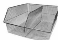
MEDIMESH - BASKET STAINLESS STEEL

MM-SS-BSK-410-450-215 410mmW x 450mmD x 215mmH - 8mm