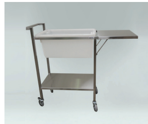
SP443.7 BIN TROLLEY

Dimensions: 725W x 425D x 900H Shelves: 1 x bottom, 1 x drop down shelf 400mmW Push handle: 1 x 1000mmH Zinc plated castors: 4 x 100mm, 2 x swivel, 2 x Brake Other: 1 x bins (645 x 413 x 276) Construction: #304 stainless steel / welded