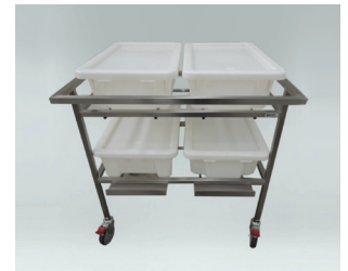
SP443.8 BIN TROLLEY

Dimensions: 890W x 710D x 1000H Top of tub approx. 1000H Shelves: Top shelf only - 4 x Rails Zinc plated castors: 4 x 125mm castors, 2 x brake Other: Side by side bins 2 x 713 x 442 x 382 Push handle Construction: #304 stainless steel / welded