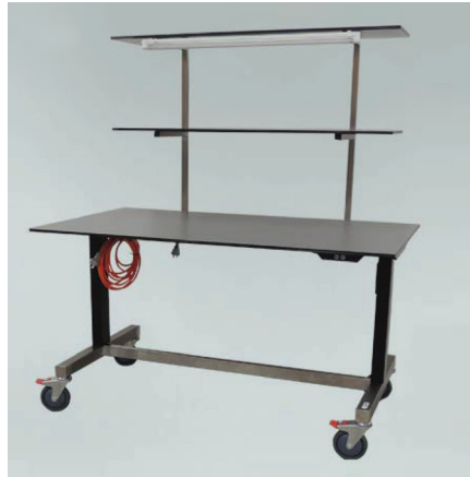
SP534.1 HEAT SEALING STATION HEIGHT ADJUSTABLE - ELECTRIC 240 VOLT

Dimensions: 1400W x 800D x (800 to 1450H) Shelves: Compact Laminate Working Surface 2 x Compact Laminate Storage Shelf (1200 x 300) Castors: 125mm 2 x Swivel, 2 x Locking Other: Over bench light, Located under top storage shelf Standard shelf Standard colour is white Other colours may be available at additional cost