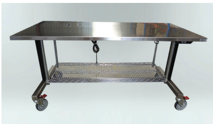
SP660.1 HEIGHT ADJUSTABLE TABLE ELECTRIC - 240V

Dimensions: 1500W x 750D x (800 to 1450mmH) Shelves: 1 x lower stainless steel wire shelf (450 x 1250) Castors: 4 x 125mm, 2 x locking, 2 x swivel Construction: Stainless steel / welded