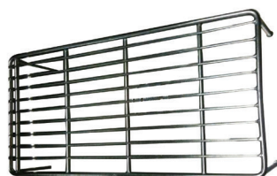
AO-SI-02 RECTANGULAR SINK INSERT

Stainless Steel Wire Mesh 400mm Diameter 100mm High