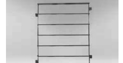
MEDIMESH - BASKET STAINLESS STEEL

MM-SS-BRT-01 485mm x 485mm Stainless steel Designed to be mounted