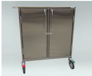
SP398.7 CSD CASE CART

Dimensions: 880W x 650D x 970H (960 wide inc. bumpers/push handles) Doors: Fully enclosed with front doors Shelf: 1 x fixed wire shelf, 1 x top, 1 x bottom shelves Handle: 1 x push handle, LHS Castors: 2 x 125 directional, 2 x 125 locking Buffers: 4 x corner buffers Construction: Fully welded / stainless steel Other: Swivel latch, flush door handles, chain so doors only open 135 degrees