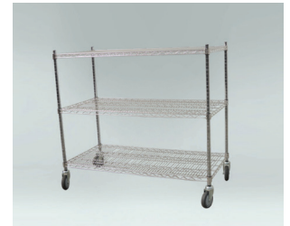
SP440.22 WRAP RACK

Dimensions: 1250W x 600D x 1160H Shelves: 3 x mesh shelves Castors: 4 x 125mm, 2 x brake, 2 x swivel (zinc plated) Request a quote for stainless steel castors Other: Stainless steel