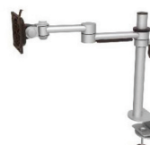
AO-MONITOR MONITOR BRACKET

Desk mounting clamp Construction: Powder coated steel