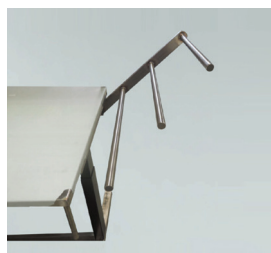
AO-WRAP RACK THREE BAR WRAP RACK EXTENTION

Fitted to height adjustable tables during manufacture Dimension: 430 x 700 x 430H