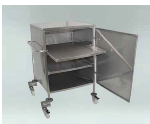
SP398 CSD CASE CART

920 x 650 x 970 (1070 wide inc push handles) Fully enclosed with front doors, 1 x fixed wire shelf, 1 x top and 1 x bottom shelves 2 x 125 directional, 2 x 125 locking castors, 4 x corner buffers