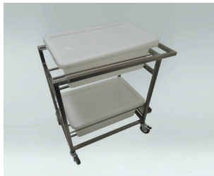
SP443.4 BIN TROLLEY

Dimensions: 700W x 500D x 800H (top of tubs 900) Zinc plated castors: 4 x 100mm, 2 x brake Other: Bins 2 x 645 x 413 x 210 Slide to front with lids Bins above each other with 300mm gap Push handle and lid holders Construction: #304 stainless steel / welded