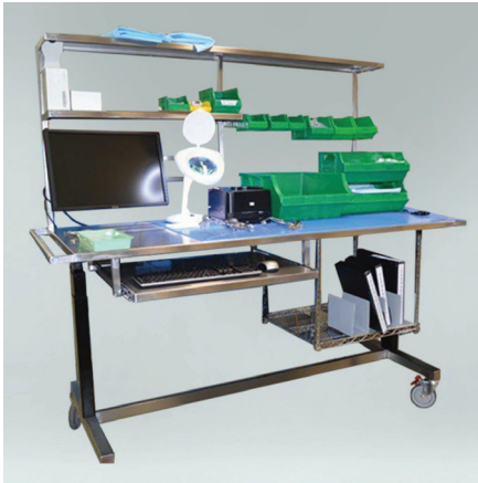
SP537.1 HEIGHT ADJUSTABLE CSD WRAP STATION ELECTRIC - 240V

Dimensions: 1800W x 750D x (800 to 1450mmH) Shelves: Full length top shelf 250mmW (700mm from benchtop) 1/2 middle shelf 250mmW (400mm from benchtop) 1/2 length maxi bin rail (400mm from benchtop) 1 x Lower stainless steel mesh shelves (1500mm x 450) Sliding shelf for keyword/mouse 700Wx500mmRHS Handles: Push handles both ends Castors: 125mm, 2 x Locking Castors, 2 x Swive Other: CPU and monitor holders 8 Port GPO with double pole switching, designed to AS3200