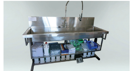
SP544.1 HEIGHT ADJUSTABLE SCOPE SINK ELECTRIC 240V

Dimensions: 1850W x 500D x (800 to 1200)H Bowl: 3 x 500 x 450 x 200 deep Bench: Wet Edge Optional: 1 x Lower S/S Mesh Shelf