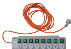
AO-GPO 8 PORT GPO

Mounted during manufacture 6 metre 15 amp cord GPO with double pole switching, designed to AS3200