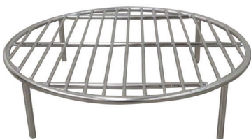
AO-SI-01 CIRCULAR SINK INSERT

Stainless Steel Wire Mesh 400mm Diameter 100mm High