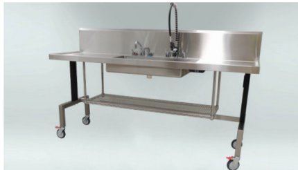
SP540.1 HEIGHT ADJUSTABLE CENTRE BOWL SINK UNIT (1 SINK) ELECTRIC 240V

Dimensions: 2000W x 650D x (900 to 1150)H Bowl: 1 x 600 x 450 x 200 deep Rear Splash Back: 300mm - Rear Only Bench: Wet Edge Optional: Lower Mesh Shelf (Picture shown with optional Solid S/S Shelf)