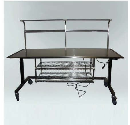
SP540. 1-R HEIGHT ADJUSTABLE RHS SINK UNIT (1 SINK) ELECTRIC 240V

Dimensions: 2015W x 750D x (800 to 1450mmH) Shelves: 2 x Lower stainless steel mesh shelves (450 x 1250) 2 x 125mm swivel, 2 x 125mm locking castors Handles: Push handles both ends Castors: 2 x 125mm swivel, 2 x 125mm locking Other: Upper maxi bin rail, 2 x Steri peel holders