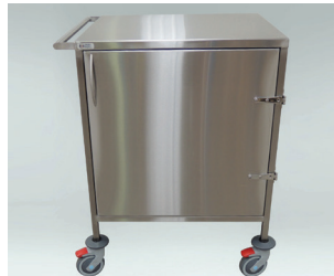
SP398.8 - CSD CASE CART - FOR TROLLEY WASH SYSTEM

Dimensions: 730W x 660D x 1000H (+ push handle) Doors: 1 full size Shelf: 2 x mesh fixed shelves, solid base 300mm from floor Handle: 1 x LHS 1000 high horizontal Castors: Stainless steel, 2 x 125 directional, 2 x 125 locking Construction: Fully welded / 304 stainless steel rated to 120 degrees celsius