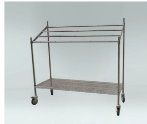
SP440.22 WRAP RACK

Dimensions: 1500W x 600D x 1450H Shelves: Stainless steel medimesh bottom shelf 4 x offset racks Castors: 125mm, 2 x brake, 2 x swivel Other: 5 x rubber rings per horizontal to prevent slipping Construction: stainless steel / welded Other sizes available. SP440.21 - 1250 x 600 SP440.23 - 1750 x 600