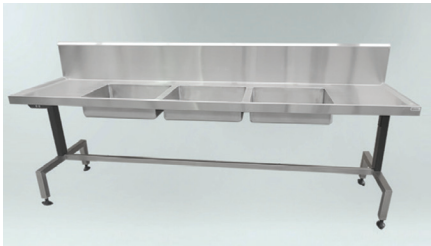
SP540.3 HEIGHT ADJUSTABLE SINK UNIT (3 SINK) ELECTRIC 240V

Dimensions: 1850W x 500D x (800 to 1200)H Bowl: 3 x 500 x 450 x 200 deep Bench: Wet Edge Optional: 1 x Lower S/S Mesh Shelf