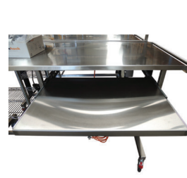
AO-KEYBOARD SLIDE OUT KEYBOARD SHELF (600 X 400)

Mounted during manufacture Construction: Stainless steel / welded