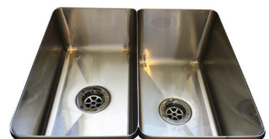
AO-SI-03 DOUBLE SINK INSERT

450 x 400 x Left bowl 150 deep Right bowl 200 deep Plug and Waste